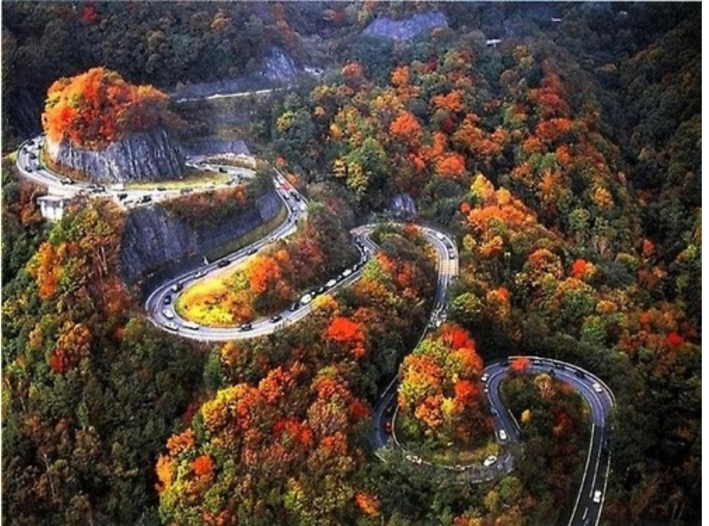
Tail of the Dragon